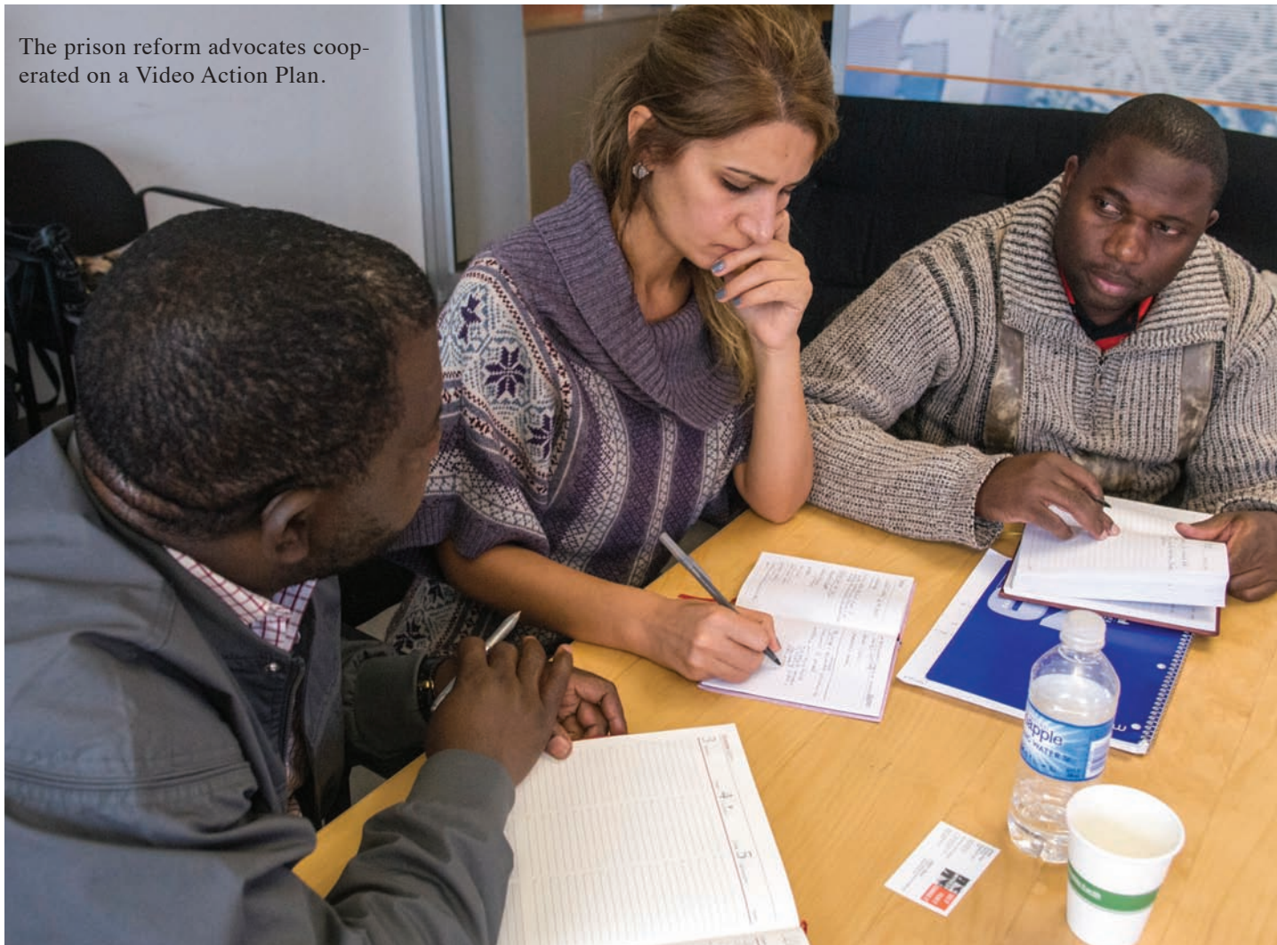
The prison reform advocates cooperated on a Video Action Plan.