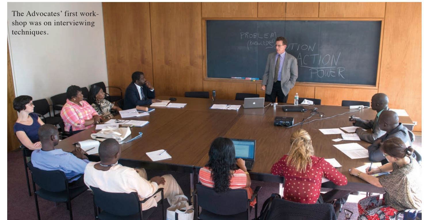
The Advocates’ first workshop was on interviewing techniques.

The 2013 HRAP marked the program’s 25th class. Through academic coursework, skills-building workshops and networking opportunities with the human rights, academic and donor communities in NYC and D.C., HRAP has strengthened the skills,