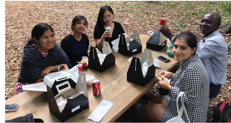
If it's a boxed lunch, it must be HRAP!

Having the opportunity to speak to the advocates candidly around LGBTI rights in their countries was incredibly inspiring. The HRAP advocates' thoughtful questions helped me think through my organization's role and critically think of the next steps for the LGBTI movement. I hope they learned from me as much as I learned from them.