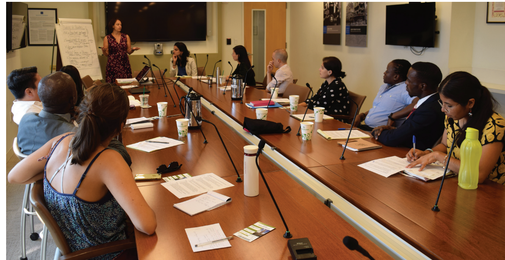
Human Rights Watch offered the advocates a six-part workshop on Research, Writing and Documentation.