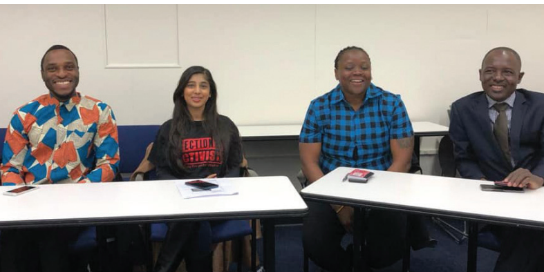
The Advocates spoke to students on both the Morningside and medical campuses.

We at the Mailman School Department of Population and Family Health were honored to interact with the heroic advocates in the 2019 class. Their presentations of their work to our students were compelling. Their sharing of pertinent insights in our Health and Human Rights Advocacy class was a great contribution. In addition, we are delighted that their presence has led in a couple of cases to conversations about possible practicum experiences for our students in their respective organizations, on which we are following up. The inspiring examples of these advocates' work could not be more helpful as we try to underscore for our students the essential importance of rights-based approaches to public health problems.