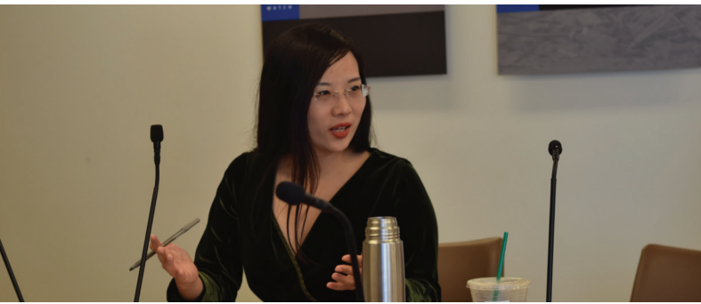
HRAP workshops are highly interactive.