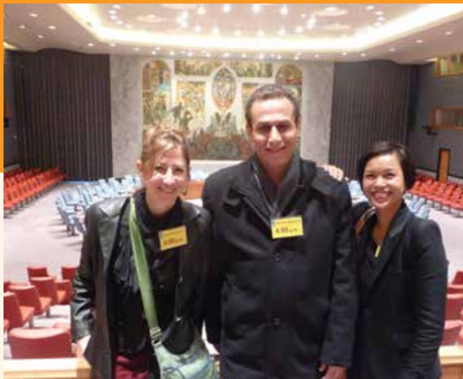
(Left): Touring the United Nations.