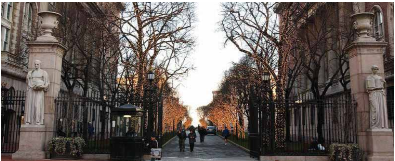
The main gates to Columbia University