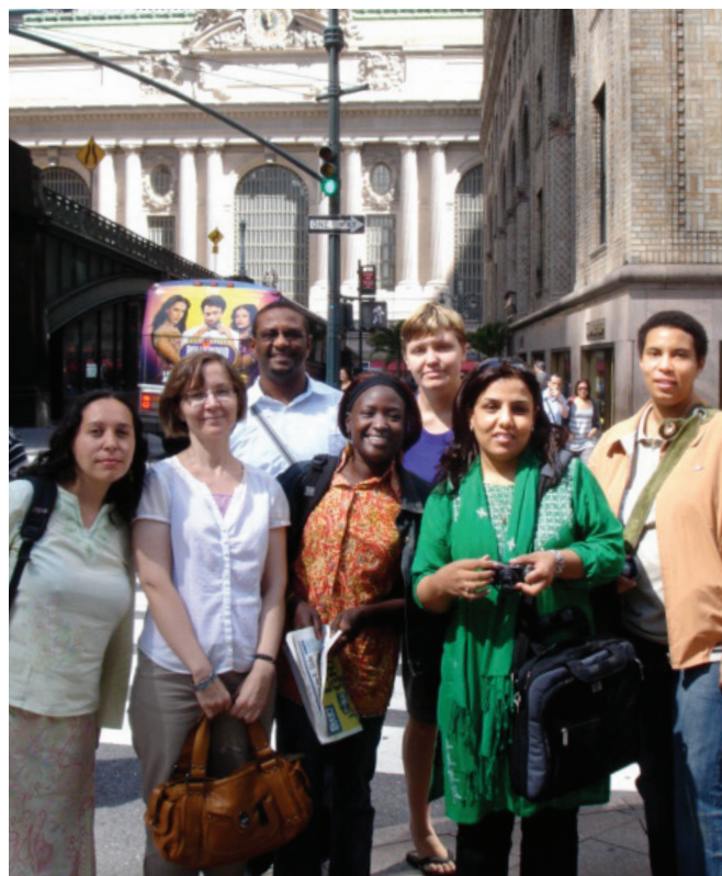
The Advocates and Stephanie did some sightseeing between workshops.