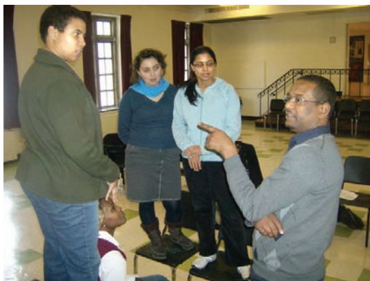
The Advocates during the workshop on The Theatre of the Oppressed.