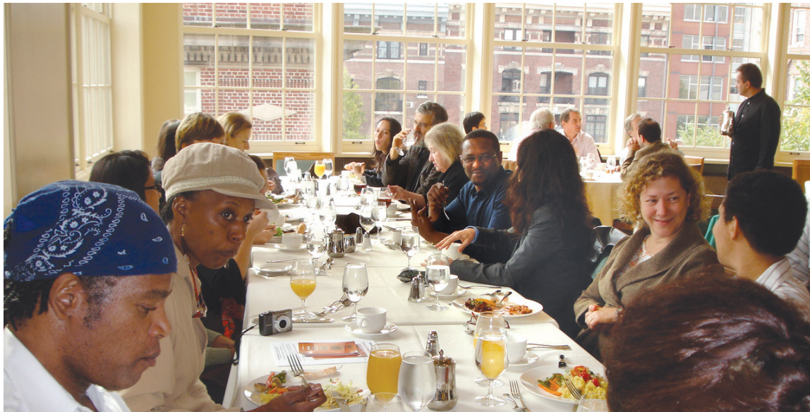
The Advocates, their faculty mentors, CSHR staff and other friends of HRAP attended a luncheon at Faculty House.

At the United Nations Association of the USA on Human Rights Day, the Advocates spoke to NYC high school teachers and students about their work.