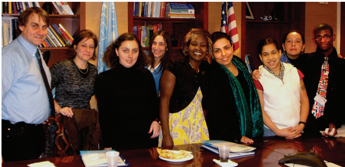
The Advocates met with teachers, students and UNA-USA staff after their presentation to mark Human Rights Day.

American University, Peacebuilding & Development Institute amfAR – The Foundation for AIDS Research Center for Health and Gender Equity Center for International Environmental Law Chemonics Child Labor Coalition Conrad and Scherer, LLP Counterpart International Different Avenues