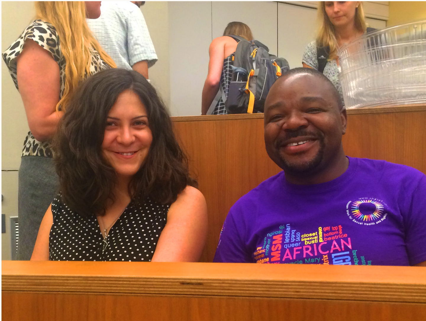
The Advocates regularly attended events and talks of interest to them at Columbia.

I have always believed that theatre is a powerful tool for social justice, and it has been an enormous pleasure for me to share my passion for both with the students in the HRAP program. Moreover, their courage and commitment has been truly inspiring. Due to the nature of this workshop, I not only get to learn about the work they are doing, but about the personal journeys that fuel their work. I am always struck with how eager and open they are to dive in to the process, regardless of their writing experience and language barriers. In the short time we have, many of them create insightful, often humorous, and moving work.