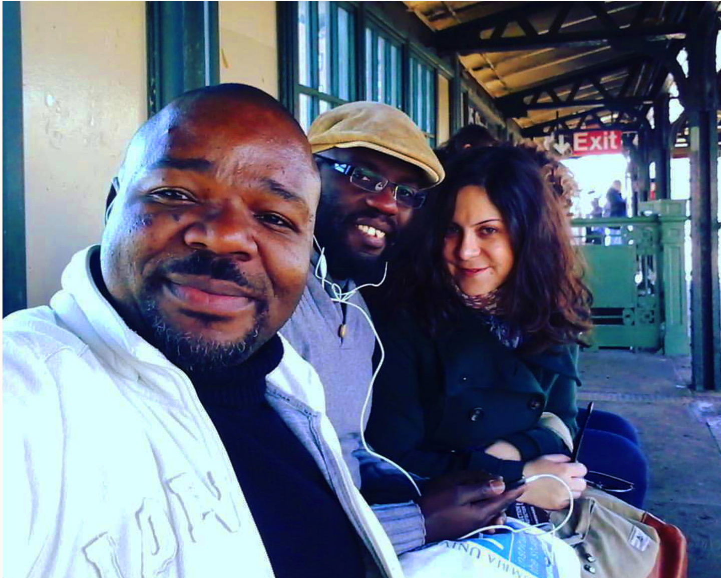
Several Advocates traveled regularly to the Medical Center campus for meetings and classes.

that is offering education to different partners in the region.