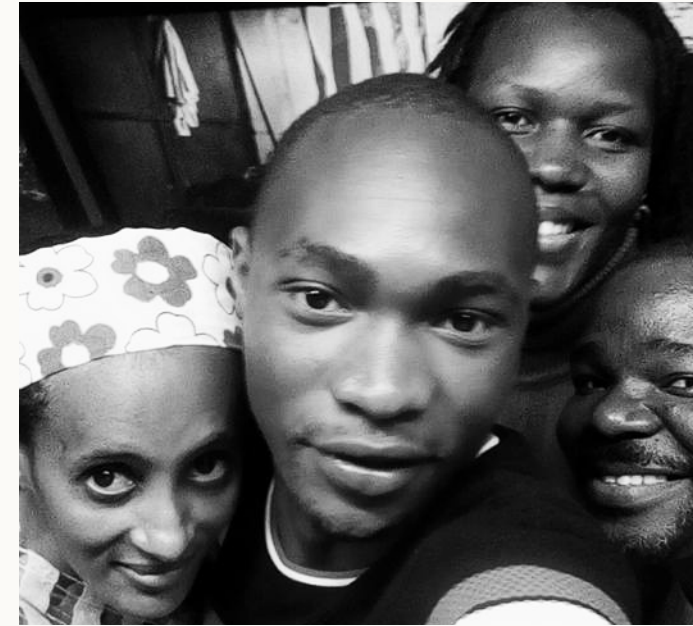
The Advocates lived at International House while in HRAP.

I am up close and personal with the challenges faced by human rights advocates while they advocate for the rights of their communities. These include torture, detention without trial, mob attacks, trauma, restrictive laws, hostile rhetoric