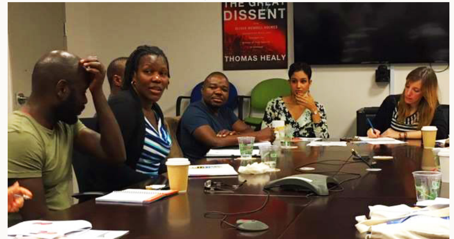
The Advocates traveled to DC where they met with organizations including Robert F. Kennedy Human Rights.