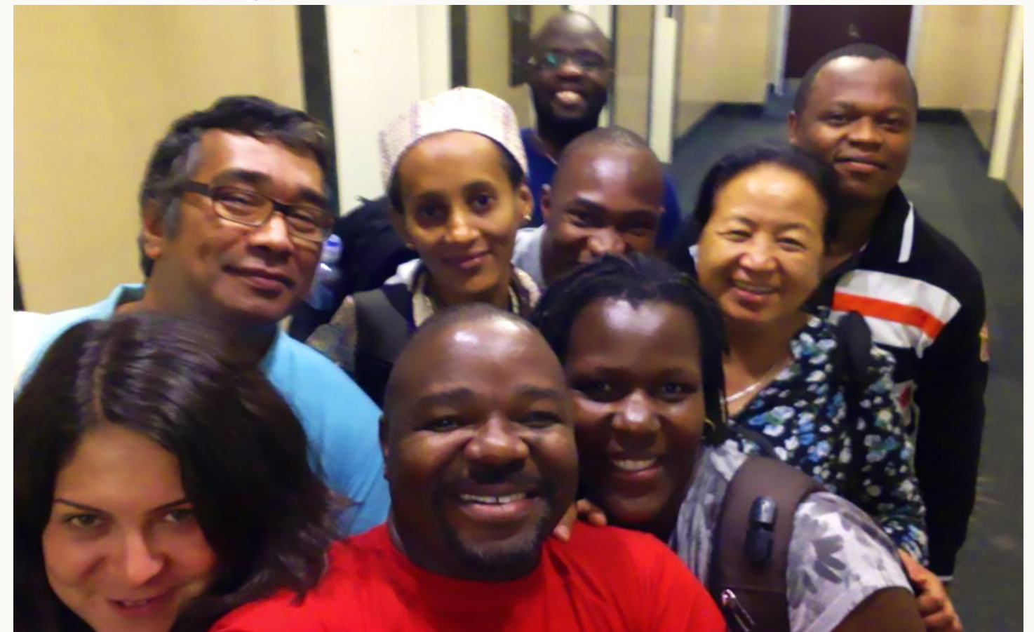
The 2016 HRAP at Human Rights Watch.

The HRAP curriculum comprises academic coursework, skills-building workshops, mentoring and networking with the human rights, academic and donor communities, primarily in New York City and Washington, D.C. The 2016 Advocates came from Armenia, Cameroon, the