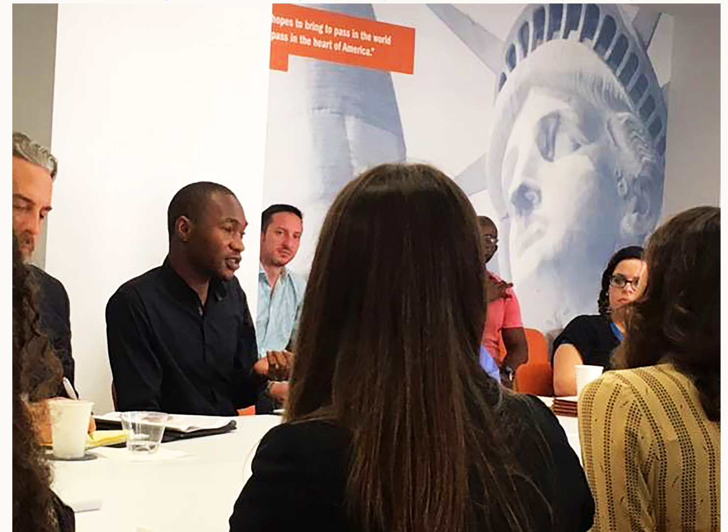
Staff from more than 10 organizations attended a presentation by the LGBT advocates hosted by Human Rights First in DC.