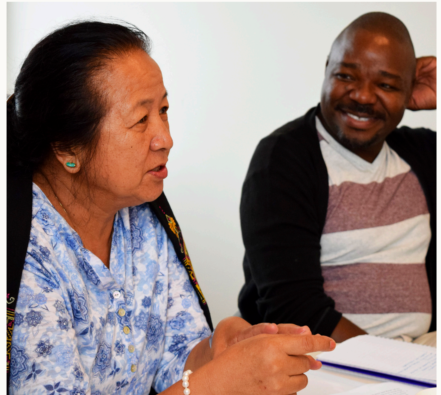
Advocates find that peer-to-peer learning within the cohort is one of HRAP's greatest benefits.

My own family's story brought me to recognize gender inequality as a crucial societal problem that must be addressed.